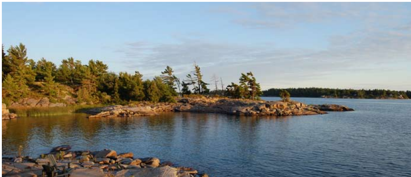
Cove by Main Cottage