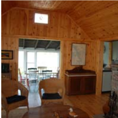
> Living room