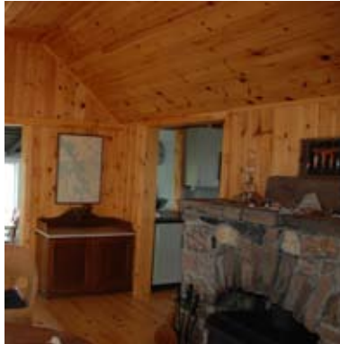
> Living room