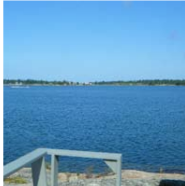
> Open western view