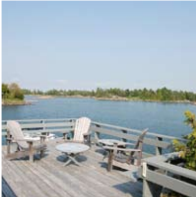
> Front deck