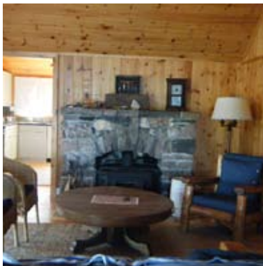
> Living room